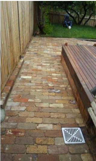
Side access viewed from front