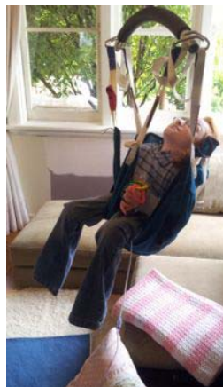
Using the hoist to get from the floor to the sofa