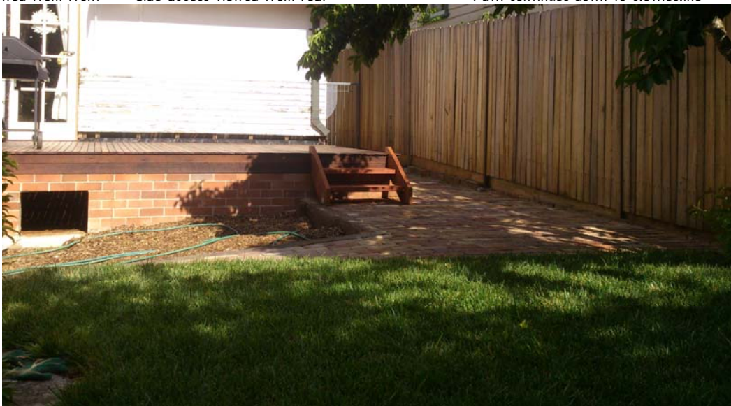
Lawn area, deck, back stairs and back door