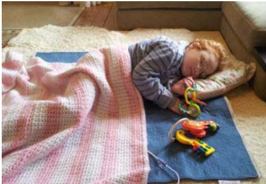
Comfortable on the floor

Isabella likes to lie on the lounge room floor, where she can move herself around a little and be in amongst everyone. Due to her frequent seizure activity and inability to shift her weight effectively Isabella needs a soft surface to lie on so she doesn't get sore or injure herself on our floorboards. We used to place gym mats with a thick blanket on the floor for Isabella however as she got older, heavier and less mobile the gym mats were not providing enough padding and Isabella would quickly become uncomfortable. We were able to purchase a double bed size latex mattress topper with a waterproof cover and a sheepskin rug to put on top. The mattress topper is firm enough that Isabella can easily move around if she wishes, but it is comfortable enough for her to spend the entire day on.