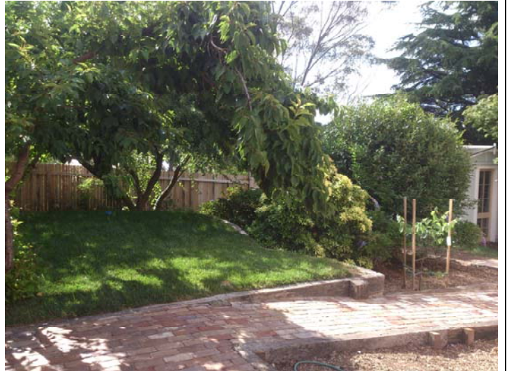
Path continues down to clothesline