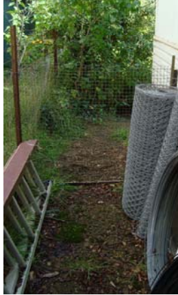
Side access viewed from front