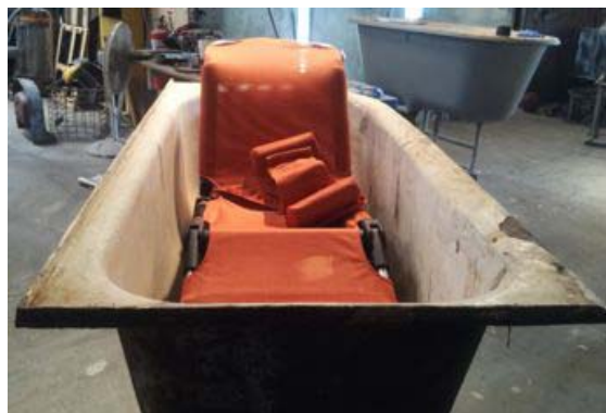
The Bathtub, before restoration, with Isabella's bath chair inside. The bath is unique both for its size, it is long and narrow, and the fact that it can be tiled into a corner making it more compact and easier to clean around. It also has extra tall feet which aid us in bathing Isabella and will help when cleaning underneath it.