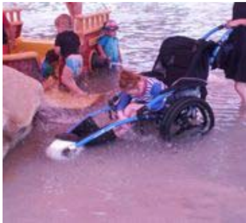
Splashing around at Jamberoo