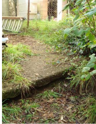
Side access viewed from back