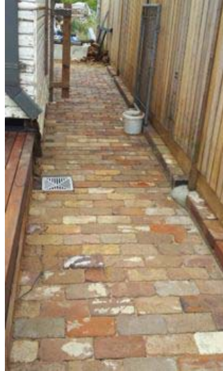
Side access viewed from rear